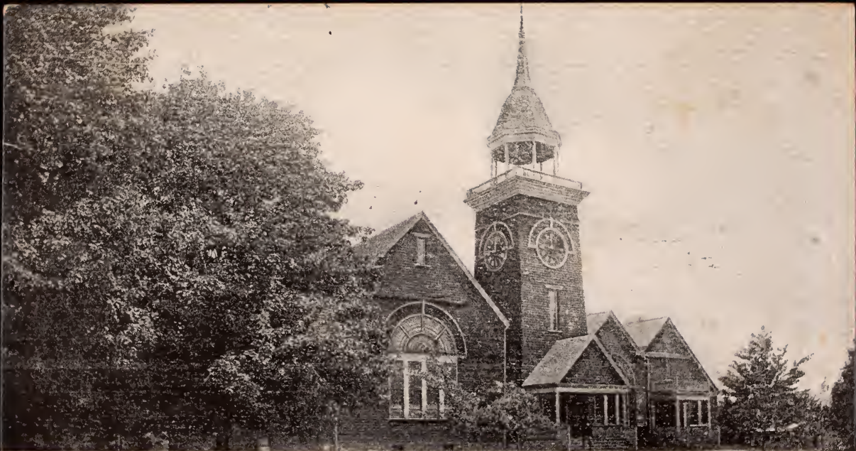
FIRST CHURCH, ORGANIZED 1702, DANVERS, MASS.